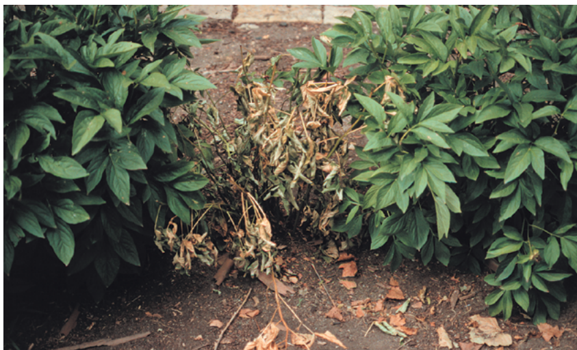
FIGURE 5 A wilted, collapsed peony (center) whose fronds were attacked at the base by Sclerotium rolfsii . The source of the fungus was a nearby, infected hosta.