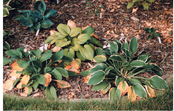
FIGURE 1 A hosta bed showing the leaf yellowing typical of crown rot.

Symptoms begin to appear on hosta after prolonged hot, humid weather. The lower leaves begin to turn yellow, then brown, and wilt from the margins back toward the base (Figures 1, 2, and 3). The upper leaves may soon collapse, too. The wilted leaves can be easily pulled from the crown, because they have been attacked at the base of the petiole. The bases of these damaged petioles show a brown discoloration and mushy texture (Figure 4). Plants with less succulent stems, such as peony, are girdled at the base of stems, causing discolored and wilted leaves, but the stems may not collapse (Figure 5). Fluffy white threads (mycelium) of the crown rot fungus typically are present on the rotted tissue and surrounding soil (Figure 6). A closer look shows small spheres, about the size of mustard seeds, sprinkled on the soil (Figure 7). These tiny spheres, called sclerotia, allow the fungus to survive cold winters and other unfavorable conditions. As sclerotia mature, their color changes from white to a light tan or reddish brown.