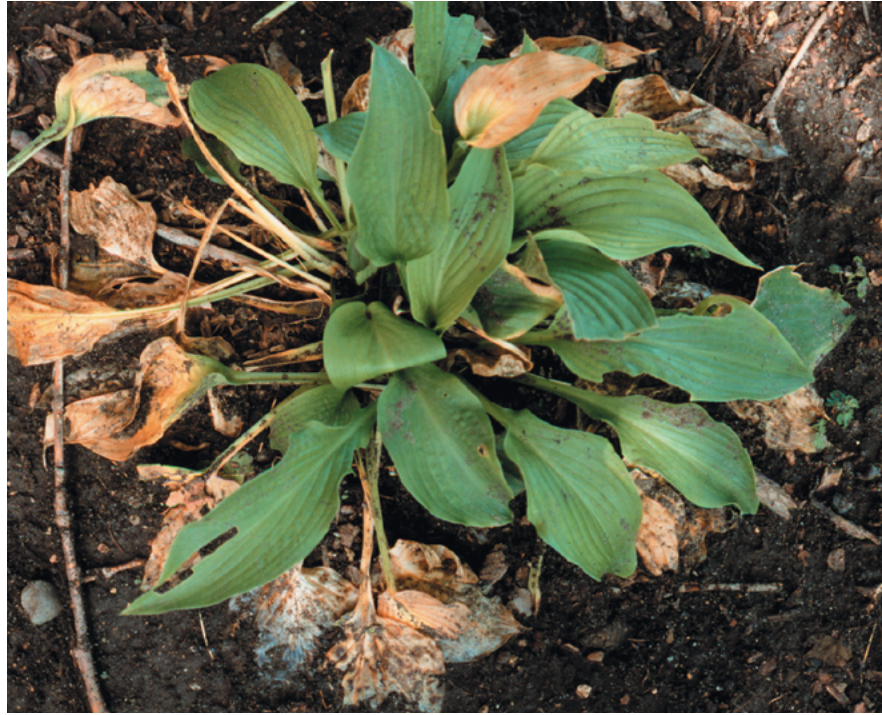
FIGURE 3 Collapse and death of lower leaves of hosta, caused by crown rot attack at the bases of the leaf petioles.