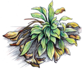
FIGURE 2 Close-up of a hosta with marginal yellowing and browning caused by crown rot.